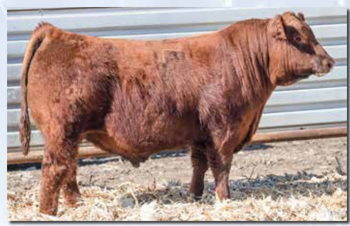
TAC DRIFTER H10