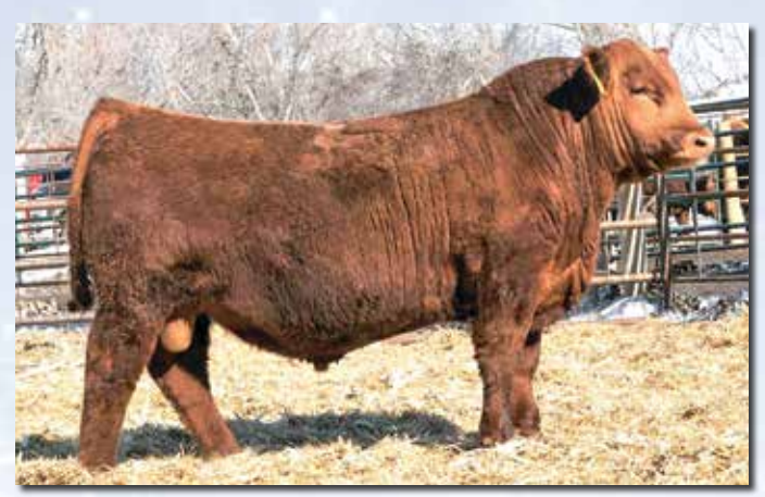
BERWALD COMPLETELY 2056