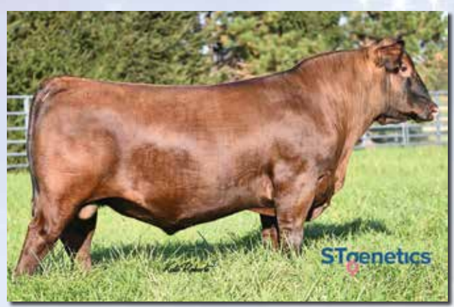
Dahlke Rancher 214K, Service Sire to Lot 15

This phenotypically stunning bred heifer boasts curve-bending growth. Starting with a birthweight of 72 lbs., she achieved an impressive 107 weaning ratio and capped it with a 110 yearling ratio. This heifer has been a standout, displaying her deep body, impeccable structure, and long, feminine appearance. She's been a personal favorite among this year's bred heifers, and we