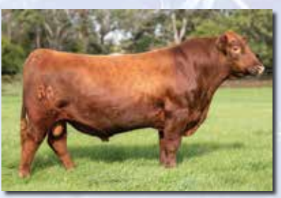
PIE HOLLYWOOD 222