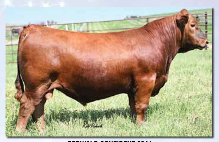
BERWALD CONFIDENT 2044