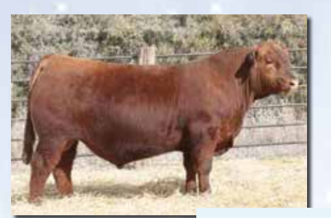
PIE CADILLAC 3289