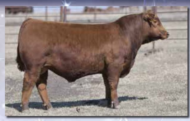
BIEBER HIGH DENSITY H558