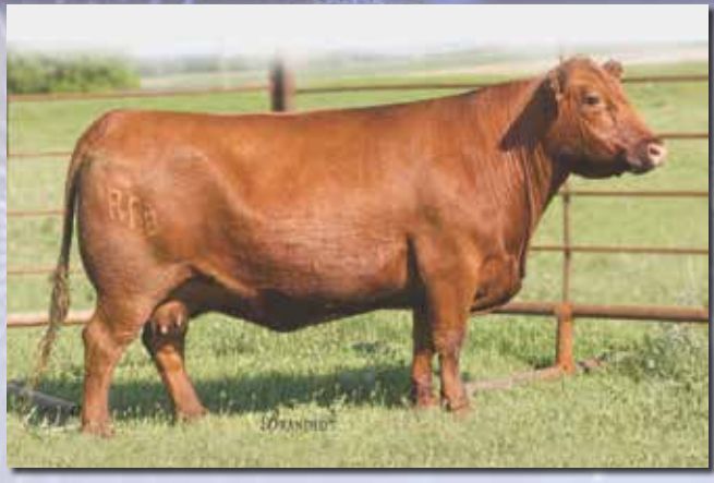
Bieber Primrose 107W, MDG to Lot 59

4018 is a super attractive, beautifully made Jumpstart heifer. She's the kind of heifer that catches your eye every time you walk in the pen. Her maternal grandmother, the great Primrose 107W, is one of the best cows on our ranch, with daughters that continue to stand out among our top cows. 4018's dam, 9180, is also a daughter of Driven C540, a cornerstone of our program for