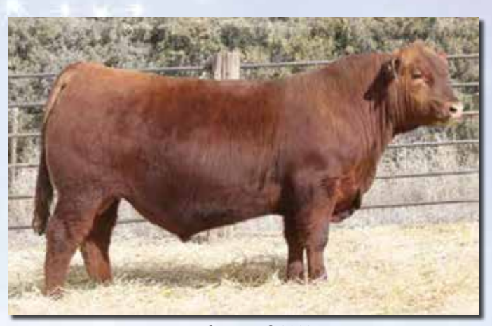
PIE CADILLAC 3289