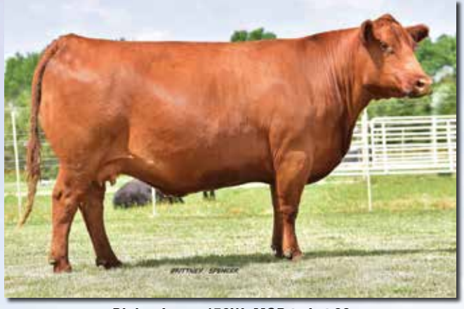
Bieber Laura 158W, MGD to Lot 33

Here's a big-time bred heifer with all the right pieces to become a donor cow. Her dam is from the SEIRRA Cow family and is already being flushed in our program. She is a full sibling to ROLLING THUNDER, now working as a herd bull at Klompien Red Angus. If you want power in the blood, this heifer is one