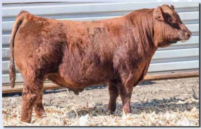
TAC DRIFTER H10