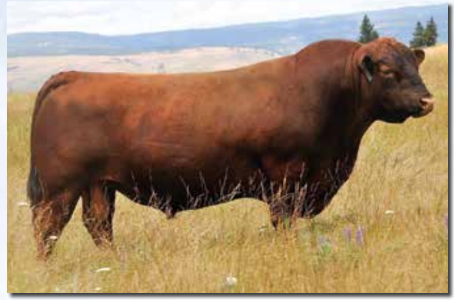
RREDS Seneca 731C, MGS to Lot 34

3156 has been a standout since she was a calf and is a genetic prospect that will certainly advance any ranch. She is a direct daughter of TAC Drifter, whose genetics are highly sought after across the country. On the bottom side, she traces back to the renowned Laura 158W, dam of Bieber Hard Drive. This is one of the best bred heifers we've ever offered and will be the