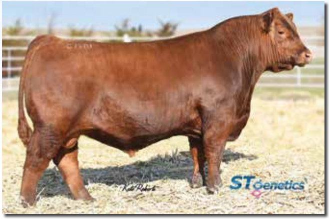
Red U2 Dominion, sire to Lot 64

A rare opportunity to purchase a direct daughter of the great Primrose 107W cow. We acquired 107W from Twedt Red Angus in their 2019 spring sale, and she has since produced outstanding females and herd sires, including Playmaker 1080J, now at ABS Global. We later sold her to Lucas Cutler and purchased this mating in the 2021 Red Select Sale. We're pleased to offer