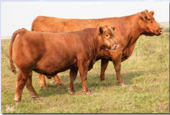
Full sib to Lot 60

4018 is a super attractive, beautifully made Jumpstart heifer. She's the kind of heifer that catches your eye every time you walk in the pen. Her maternal grandmother, the great Primrose 107W, is one of the best cows on our ranch, with daughters that continue to stand out among our top cows. 4018's dam, 9180, is also a daughter of Driven C540, a cornerstone of our program for